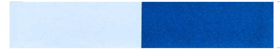
Bright Blue 15 – 70 µm Article No. 038058