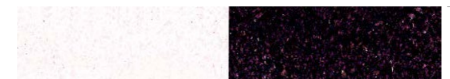
Dazzling Red 150 – 1200 µm Article No. 020387