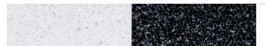
Dazzling Silver 150 – 1200 µm Article No. 020601