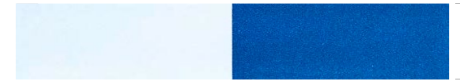
Blue 10 – 50 µm Article No. 021332