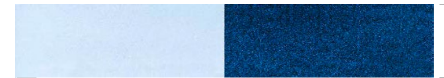
Glamour Blue 35 – 150 µm Article No. 038026