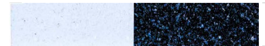
Dazzling Blue 150 – 1200 µm Article No. 020388