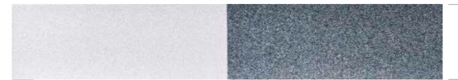
Sparkling Silver 15 – 120 µm Article No. 038001