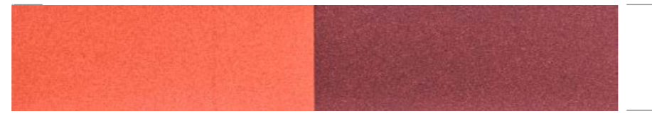
Fire-Red 10 – 50 µm Article No. 021330