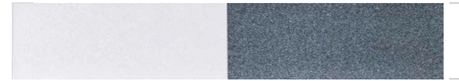
Bright Silver 15 – 70 µm Article No. 038025