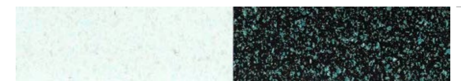
Dazzling Green 150 – 1200 µm Article No. 020391