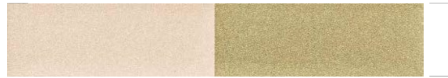
Champagne 10 – 50 µm Article No. 021333