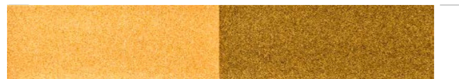
Sparkling Bronze 15 – 120 µm Article No. 038069