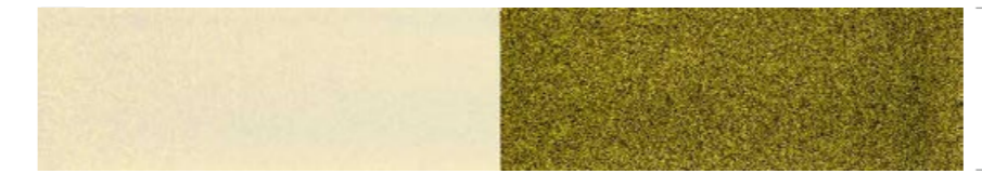
Glamour Gold 35 – 150 µm Article No. 038019