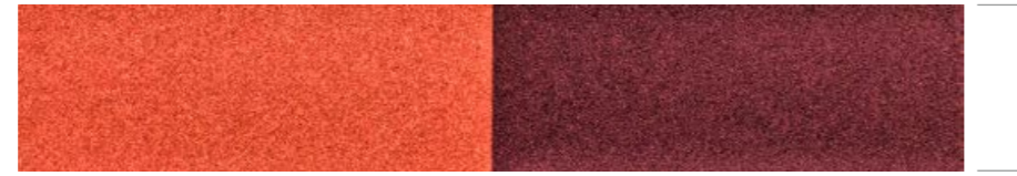
Sparkling Fire-Red 15 – 120 µm Article No. 037205