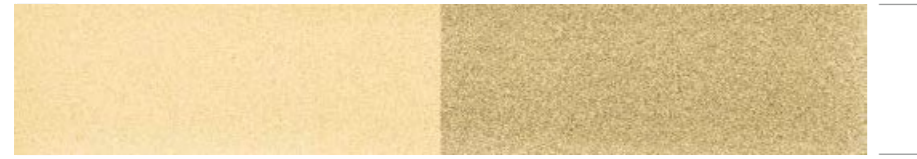
Sparkling Champagne 15 – 120 µm Article No. 037204